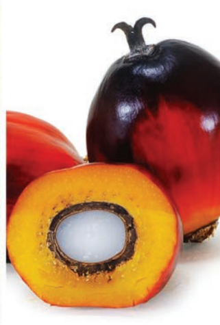
SUSTAINABLE PALM OIL